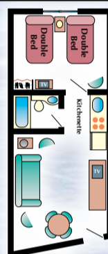
B OCEANVIEW 2-ROOM EFFICIENCY SUITES 2 TV's