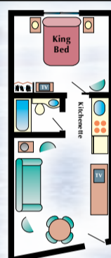
A1 OCEANFRONT 2-ROOM EFFICIENCY SUITES 2 TV's