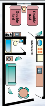
A OCEANFRONT 2-ROOM EFFICIENCY SUITES 2 TV's